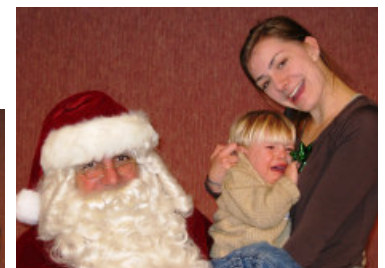
....well, not everyone!!