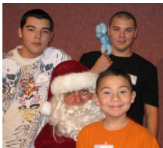
Lilly's sons show us you're never too old to sit on Santa's lap!