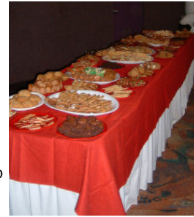
This wonderful array of homebaked goods was provided by the Quota Club of Fort Collins.