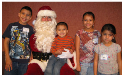
The kids enjoy seeing Santa to get their presents.....